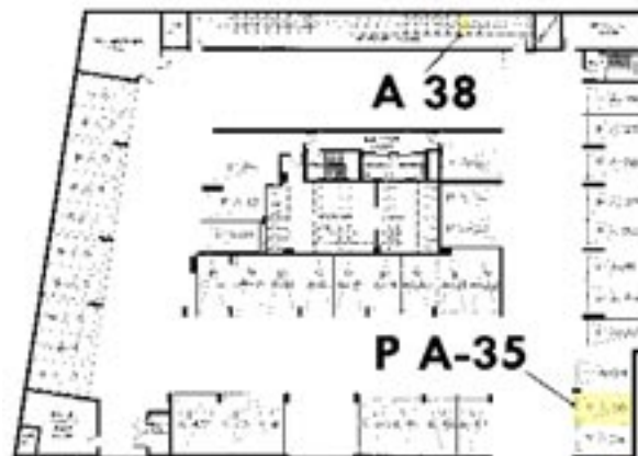
Parking & Locker Locations